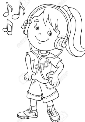
listening to music